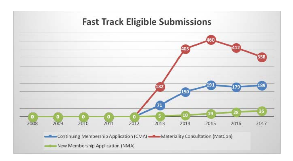
Figure 3: Number of NMA, CMA and MatCon submissions eligible for Fast Track review, on an annual basis, for the period of 2008 through 2017.

After the Department considers various factors as described in proposed Rule 1112.01, an application may be eligible to undergo Fast Track review. As an option that is provided to the applicant, FINRA believes that a firm is likely to agree to the expedited processing if the incurred cost savings are deemed to be greater than the increased costs (e.g., faster turnaround times for document requests) resulting from the expedited nature of the process. However, some firms may not want to expedite the application, as they will deem that such a process will not provide a net benefit and thus opt to go through the standard processing track. Shortening the timelines could potentially benefit the investor community by enabling the firms to provide services to their customers more quickly. As with the other efficiency improving process changes, risks to investors could arise from the expedited nature of the process, potentially leading to applications being approved that should not have been.