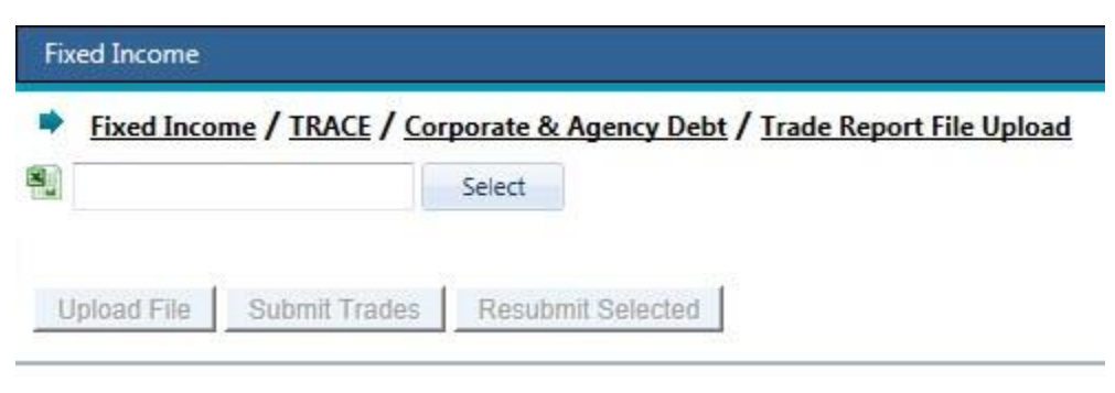
Trade Report File Upload